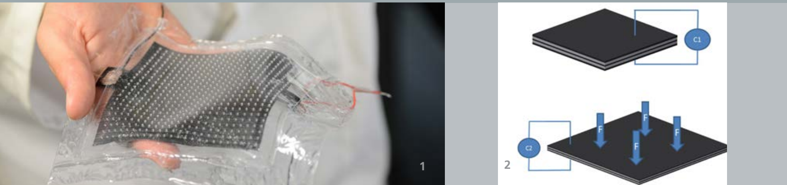
1 DES for pressure sensing 2 Rise up of capacitance of a DES caused by pressure load